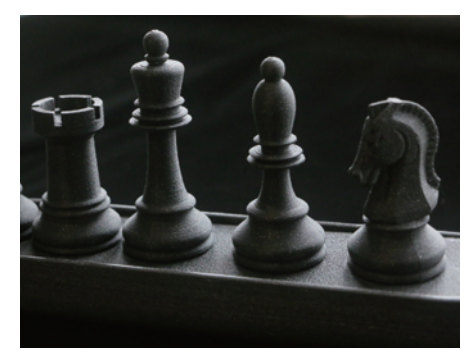
PLA-GALAXY MATTE BLACK Easy to print and has starry sky texture matte surface.