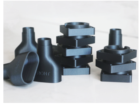
PLA-CF Wonderful smooth surface and enhanced strength.