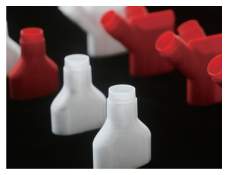
PC: High strength & High temperature resistant PETG: High transparency & wonderful toughness.