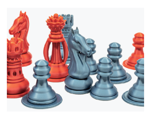
PLA-SE Easy to print and good surface.