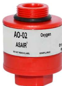
Figure 1. AO-02 Oxygen Sensor

The AO-02 oxygen sensor is designed to be for various instruments related to oxygen testing, such as motor vehicle exhaust gas detection equipment, exhaust gas environmental protection detection equipment and oxygen index testing equipment, etc. The use is limited to system monitoring. The data provided in this document are valid at 20°C, 50% RH and 1013 mBar for 3 months from the date of sensor manufacture. Please strictly follow the instructions for operating the oxygen analyzer and replacing the oxygen sensor.